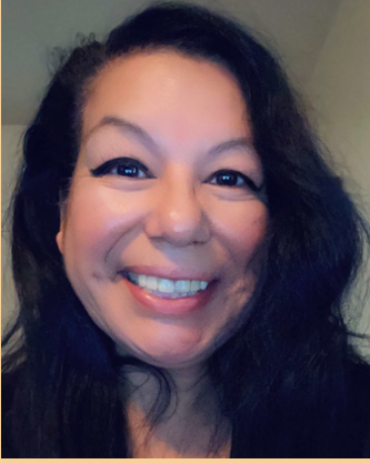
Strategic Initiatives Coordinator