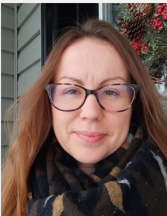
Regional Education Council Coordinator

Outside of work you will find me camping with my husband and children, gardening or hiking to a mountain top lookout to enjoy the view.