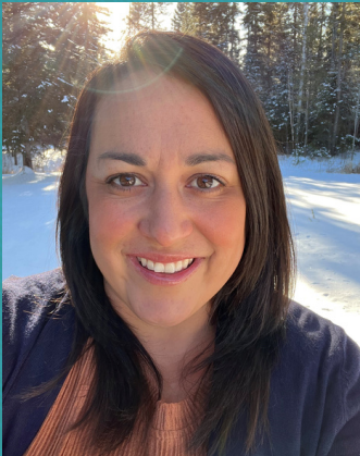
Multi-Year Action Plan Manager