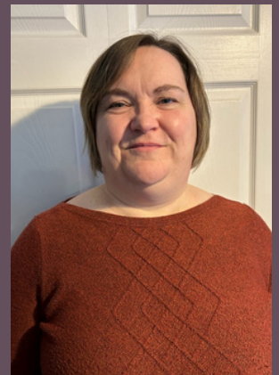
Human Resources Officer

I am thrilled to continue working at the KEB and stepping into the new role as the Human Resources Officer. Much of my career has been spent working in payroll, benefits, and human resources. I am excited to jump into the work and bring my knowledge, experience, passion, and energy to this new role. Miigwech!