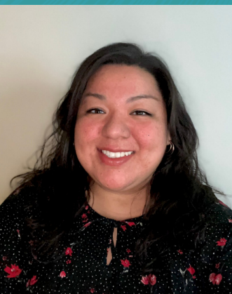
Anishinabek Education Services Manager

I am looking forward to working with KEB staff and the Participating First Nations in the role of coordinator for Regional Education Council 4. In the past, I have worked as an Indigenous Language Program Coordinator, First Nation Education Advisor, and elementary and secondary native language (Anishinaabemowin) teacher.