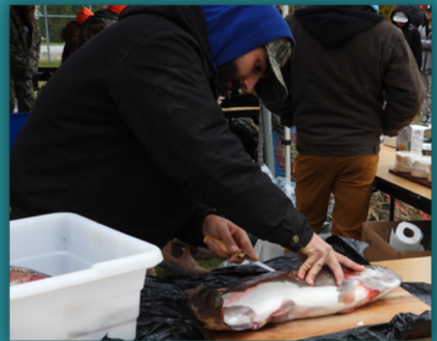
Odawa Fish Farm staff demonstrate fileting technique