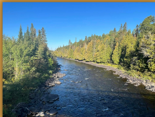
White River flows through the community nestled on White Lake